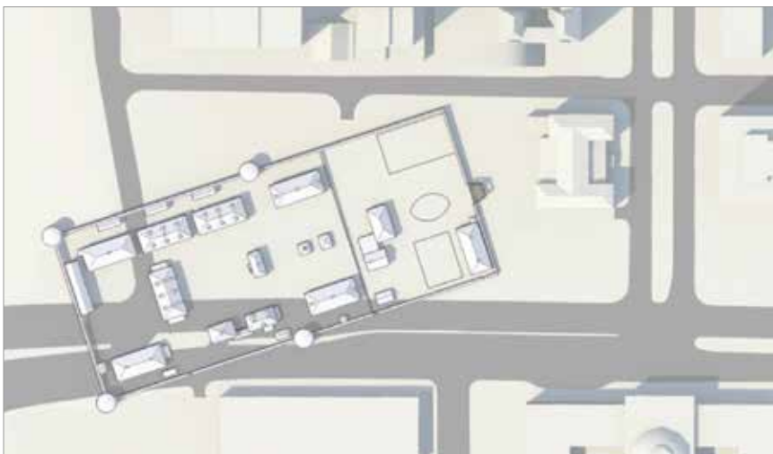
ORIGINAL FORT (1870), IN CONTEXT OVER EXISTING STREETS

Event inquiries please contact the Forks Renewal Corporation (204) 987-4378 or events@ufg.com